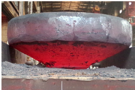
Client: China Communication Construction Company Application: 800KJ hydraulic hammer