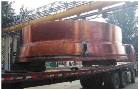
Client: Guangdong Huaerchen Application: 2000KJ hydraulic hammer