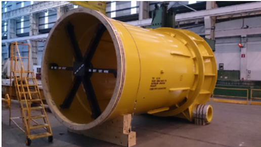
PILE SLEEVE Diameter: 2600mm