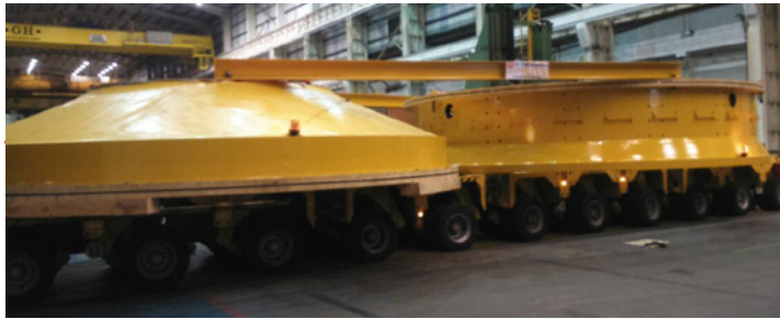
PILE SLEEVE Diameter: 6500mm